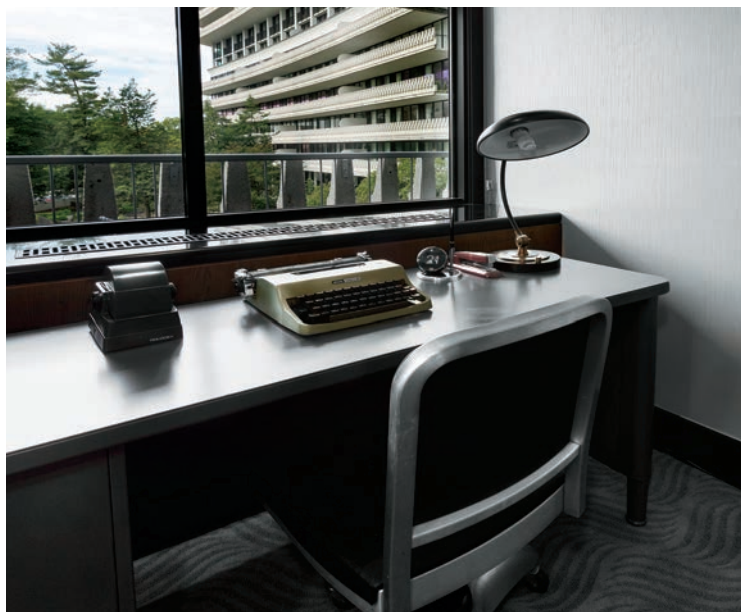
Above: The Scandal Room at The Watergate Hotel in Washington, D.C. Left: A whimsical narrative about the owner informs the design of The Darcy

In Washington, D.C., the Willard InterContinental, with the adjacent Occidental Grill & Seafood, is a recently renovated 1901 Hardenbergh-designed monolith, whose bar was immortalized in a poem by Walt Whitman. The Darcy, a Curio