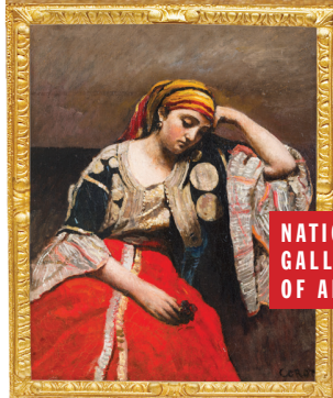
NATIONAL GALLERY OF ART

to the Harman Center for the Arts for the Washington Ballet's performances of works by Mark Morris and Merce Cunningham (beginning October 31).